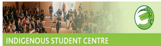
INDIGENOUS STUDENT CENTRE

The purpose of our Indigenous Student Centre is to provide easy-access resources and a friendly, home-away-from-home environment to help our students in reaching their maximum potentials. We work to provide cultural and academic support, to help bridge the gap between the University and Indigenous peoples, and to help facilitate the Indigenization of our Academy.