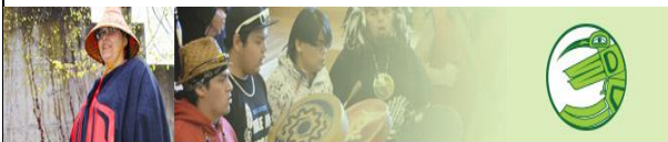
INDIGENOUS AFFAIRS OFFICE

The Indigenous Affairs Office was established in the Summer of 2009 in response to the recommendations of the Aboriginal Community Council and the Indigenizing Goals and Actions document. The Office reports to the Vice Provost and Associate Vice-President, Academic and is the primary point of contact in the development of a Department of Indigenous Affairs at the university.